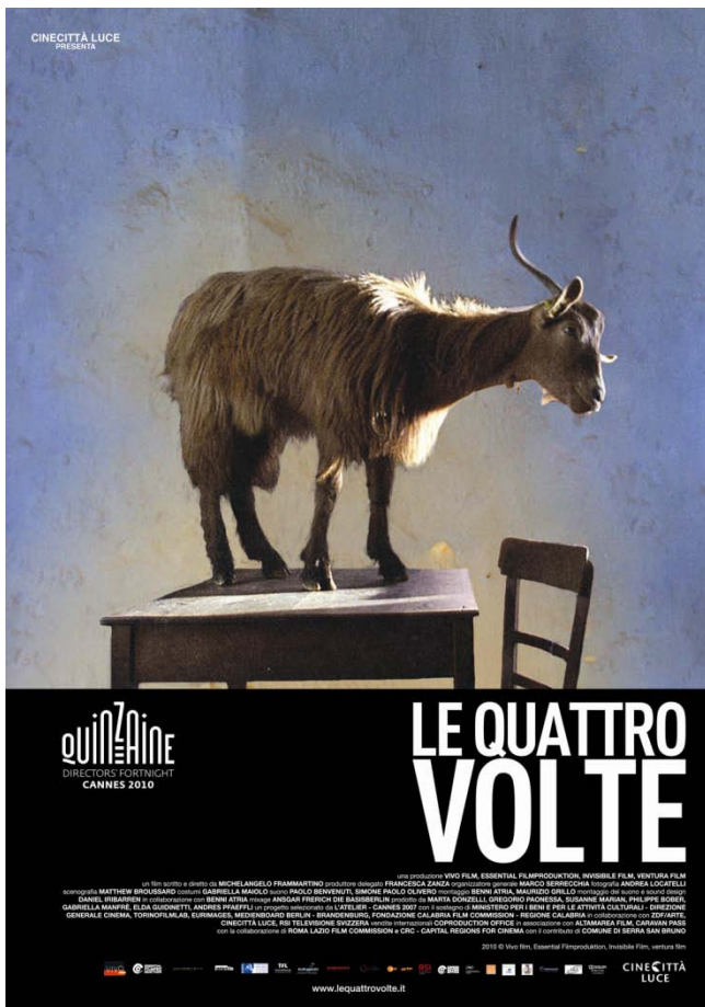
- Italian Poster -